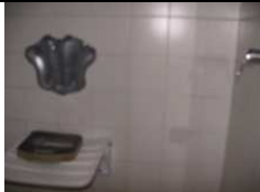
Mixer on opposite wall