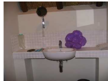
Basin access with adjustable mirror