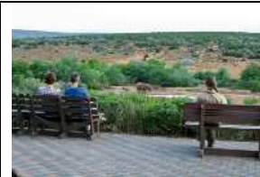
Spaces to view waterhole