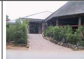
Ramp to restaurant

Hides: At the main complex there are 2 game/bird viewing hides. One (the Red Bishop Hide) overlooks a pond and reed bed – best in summer. The other is an underground hide that overlooks a waterhole on the camp's fence-line where elephants and other large game often come to drink. This waterhole is floodlit at night. There is also a viewing point above the underground hide that provides a more elevated view of the waterhole. All three of these viewing sites have wide ramped pathways and are wheelchair accessible, and the underground hide has a cleared space for wheelchair users to get up close to the viewing slot. The camp also has a swimming pool with an access pathway that is accommodating for wheelchair users