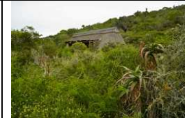
Matyholweni's cottages melt into the bush

Matyholweni Camp: Matyholweni Camp is Addo's second camp and is located in a quiet valley near the coastal town of Colchester at the Sundays River Mouth, 3km off the N2 highway. 14 accommodation units merge into the surrounding bush. In fact the name Matyholweni, means "in the bush" in Xhosa. The camp is easily accessible and provides an alternate gateway into the Park. Amenities such as shops, restaurants and a fuel station are available in the nearby town.