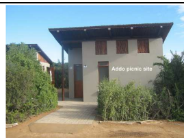
Picnic Site ablution block