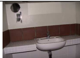
Basin and mirror layout