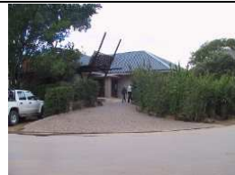
Ramp to Shop