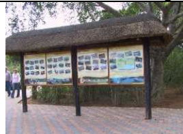
Displays at Viewing Platform