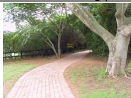
Path to Red Bishop Hide

Hides: At the main complex there are 2 game/bird viewing hides. One (the Red Bishop Hide) overlooks a pond and reed bed – best in summer. The other is an underground hide that overlooks a waterhole on the camp's fence-line where elephants and other large game often come to drink. This waterhole is floodlit at night. There is also a viewing point above the underground hide that provides a more elevated view of the waterhole. All three of these viewing sites have wide ramped pathways and are wheelchair accessible, and the underground hide has a cleared space for wheelchair users to get up close to the viewing slot. The camp also has a swimming pool with an access pathway that is accommodating for wheelchair users