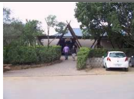
Ramp up to reception