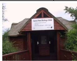
Interior of RB Hide