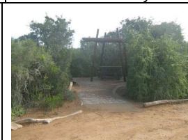
Pathway to picnic tables

In the Game Viewing Area the main facility is the network of roads for viewing wildlife. There is however a picnic site and here accessible facilities – ramps and accessible toilet has been provided. The other place one can disembark is at Domkrag Dam's lookout parking area.